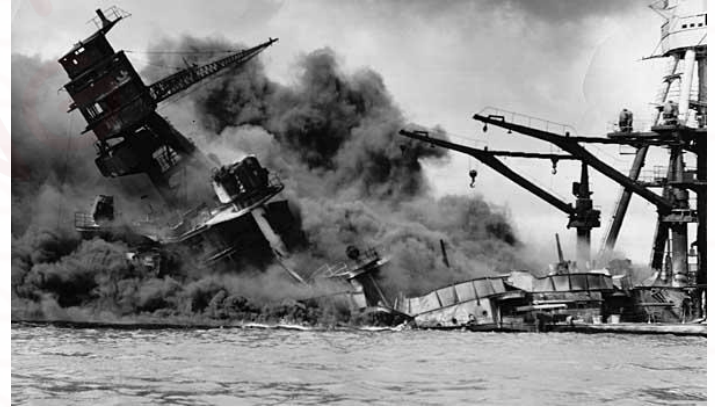
U.S. battleship sinking during the Japanese attack on Pearl Harbour, Hawaii, December 7, 1941.

President Franklin Roosevelt (of the U.S.A.) called December 7, 1941, "a date which will live in infamy." On that day, the Imperial Japanese Navy Air Service launched a surprise military strike against the United States naval base at Pearl Harbour, Hawaii Territory. The attack, also known as the Battle of Pearl Harbour, led to the United States' entry into World War II.